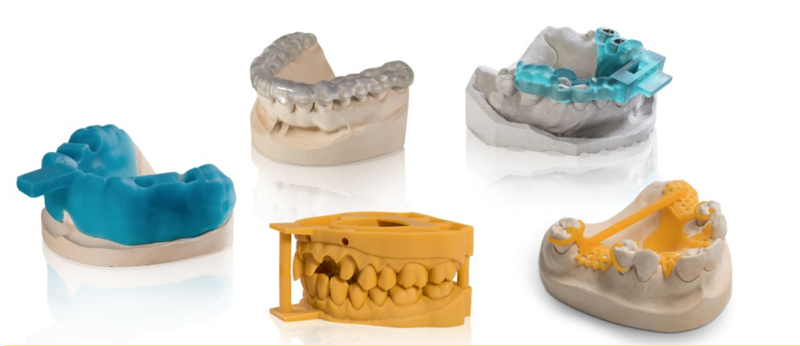
Figure 1: Dental application of 3D printing (from left to right): custom impression trays, bite-raising appliances in clear resin, dental models, surgical stents and frameworks for removable dentures.

3D printing technologies such as stereolithography (SLA), digital light processing (DLP) and selective laser melting (SLM) are mainly used in dentistry. Typical materials used for dental applications are mainly resins or metals, e.g. to fabricate restorations or accessories such as dental models. Figure 1 shows an overview of dental objects, fabricated using 3D printing processes.